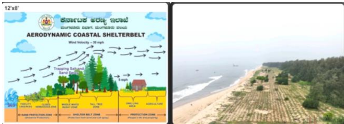
Figure 2: Aero dynamic model of plantation